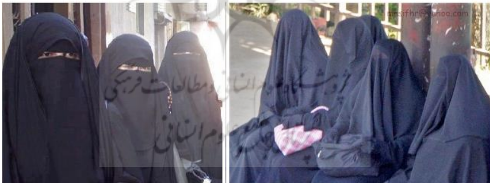
Figure 1. Examples of heavily occluded faces covered with Niqab

The successful implementation of machine learning from the stunning work of Viola and Jones has triggered a lot of improvements in face detection (Viola & Jones, 2001). The covering may be due to work requirement such as masks as in hospitals or due to religious beliefs as in some Muslim societies where ladies are required to cover their faces while being outdoors or in the presence of non-relatives.