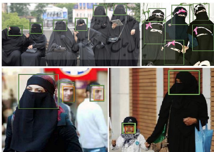
Figure 3. Example of detected faces by Niqab-Face detector indicated by green rectangle. MTCNN yellow rectangle and SSD red rectangle

The training process was performed for approximate of 8 hours until an average precision of 90% and a Recall of 73.5% had obtained. During the testing phase 30% of images not used during training were used to evaluate and measure the model's performance. The major aim of our findings is to classify occluded face within an image and providing the face location within image as set of bounding box coordinates if there is face. Niqab-Face detector has successfully identified 261 as TP, one FP, and 179 as FN, with 99% and 59% for precision and recall respectively.