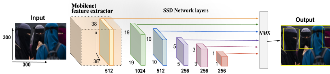
Figure 2. Mobilenet-SSD architecture composed of two parts: feature extraction and SDD

Transfer learning, which is a common deep-learning practice technique is used to train the proposed Niqab-face to speed up the training. Inspired by a work of T.-Y. Lin, Goyal, Girshick, He, and Dollár (2017); (Wan, Chen, Zhang, Zhang, & Wong, 2016) the online hard examples mining and focal loss techniques were implemented during training to minimize false alarms and improve the training. Images were preprocessed, normalized and rescaled to 300x300 to fit the recommended input size of SSD-Mobilenet.