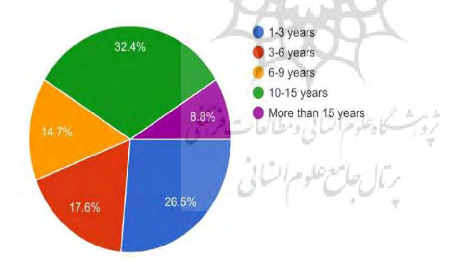
Figure 1 Participants' Demographic Information

The sample of this study comprised 120 EFL teachers in different private language centers of Urmia, Iran. Figure 1 below shows the demographic information of the participants in terms of age, years of teating experience, etc. As it is seen, more than half of the participants had teaching experience of fewer than ten years, and 41 percent had experienced teaching more than ten years.