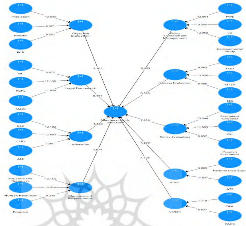
Figure 2 The main model in the case of significant coefficients

The data obtained from the field study were performed in SMART-PLS software and the following results were obtained.