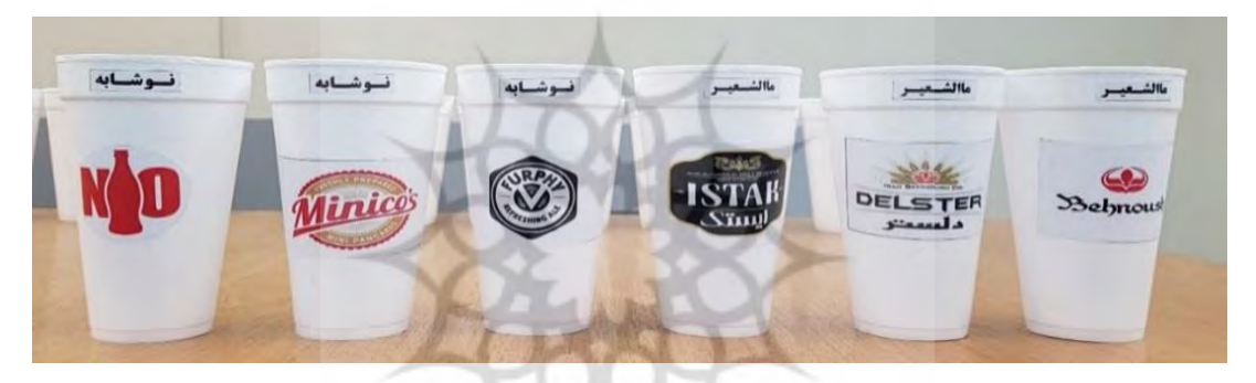
Fig1. One sample of arrangements

Therefore, each participant had to select one glass from ten different arrangements independently. The picture of one sample of arrangement is displayed in Fig1.