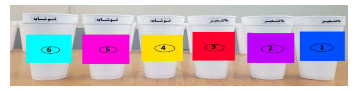
Fig2. AOIs of one of the arrangements of beverages

To verify the first hypothesis (H1), consumers' answers in their questionnaires and their selections in the experiment study arrangements were analyzed. Interestingly, for all the arrangements in the experimental group, the T-test results showed a statistically significant difference (Table3) between consumers' answers in their questionnaires and their selections. Table3 shows that the mean of consumers' selections in questionnaires is 1.66 and the means of consumer' selections in different arrangements are 1.33 and 1.38. While, in the control study, the mean of consumer' selections from different arrangements is1.66 too. Additionally, the results showed that when there were no popular brands of favorite category, 75% of the participants changed their choices and selected a popular brand of unfavorite category