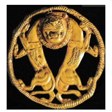
Fig. 32. (Akbarzadeh, 2012: 53) Fig.