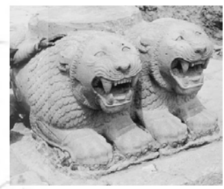
Fig. 26a. Lion Protectors from Zincirli (Frankfort, 1954: Fig. 87) Fig. 26b. Late Hittite from Tell Tainat (Winter, 2010: 278, Fig. 36)

ilarities include the configuration, face, triangle eyes, wrinkled short snout, open jaw, aligned teeth, angry face and strong and muscled bodies.