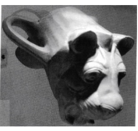
Fig. 24. Khorsabad (Frankfort, 1954: 115) Fig. 25a-b. Middle or Late Hittite from Kültepe (Yener, 2007: 227, Figs. 4-5)