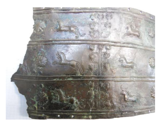
Fig. 6. No. 132 in Reza Abbasi Museum

Another association of lion and Ḥaldi has been fulfilled by the hieroglyphic sign of lion head as Ḥaldi (Diakonoff, 1983: 193; Calmeyer, 1979). This sign has been discovered separately or along with a cuneiform inscription. The author called this sign as the king or his power or his command (Dara, 2018b: 44). Also, the lion body (not the head of course)