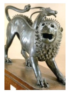
33. Florence Museum