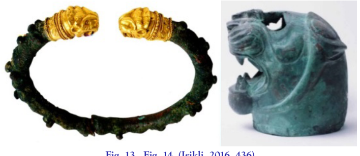
Fig. 13, Fig. 14. (Işikli, 2016, 436)