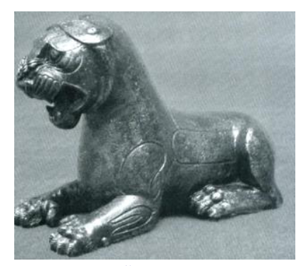
Fig. 4. (Seidl, 2004: TAFEL 3c)

Haldi, the supreme deity in the Urartian pantheon, was War Deity. He was associated to the king and his power and triumph. He is believed to be pictured in front of deities' garrison attacking Assyrian soldiers in the shield from Upper Anzaf (Fig. 18). But some scholars mentioned Haldi as the lion rider deity according to a picture in Haldi's temple in Erebuni (Fig. 5). In deed the lion rider deity is rarely pictured in the Urartian art. The deity- with or without the winged disc-riding on the bull is more illustrated in Urartian art (Fig. 19). It seems that the winged disc deity over the bull has been pictured from almost the beginning of the Urartian kingdom – as Upper Anzaf shield. According to Piotrovskij (2004: 309, 312) it is possible that lion could be the symbol of offering to Haldi. It seems that he has associated lion with Haldi according to the Near Eastern model.