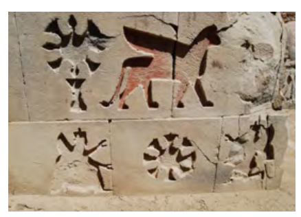
Fig. 7. Ayanis Bas-relief

bodies, movements and the configurations. According to Azarpay (Ibid: 37, 39) the Urartian lion is very much affected by the Assyrian one but sometimes there are doubled lines on the Urartian lions' neck which are different from Assyrian lions. Also the snouts in the Assyrian art are sometimes longer and less wrinkled. The recognition of Urartian and Assyrian lions are very difficult and sometimes impossible when the Assyrian lions are pictured with wrinkled short snout, curled tails and muscled bodies. The Assyrian male lions are sometimes illustrated with the long mane but when they were pictured as female or with short mane the recognition of the Assyrian and Urartian lions are very difficult. Their walking style was also very similarly depicted (Frankfort, 1954: 80). The Hittite lions were also mostly very much similar to the Urartian ones (Fig. 25) but sometimes slightly different (Fig. 26).