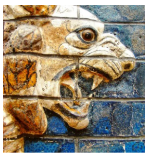
Fig. 22b. (Majidzadeh, 2009: 376), Fig. 23a Ninurta Temple in Nimrud from Ashur-Nasirpal (2009: 454) Fig. 23b Ishtar Gate