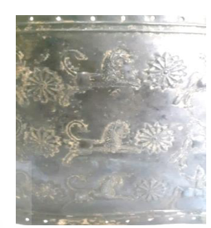
Fig. 19a. (Konyar et al., 2018: 195) Fig. 19b. (Tarontsi, 2017: Photo 4) Fig. 20. (No. 143 in Reza Abbasi Museum)