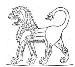
Fig. 17c. From Rusa III's Reign in Toprak Kale(Ibid: plate 58) Fig. 17d. From Sarduri II's Reign in Karmir-blur (Ibid: Fig. 8)

triangle eyes, open jaw, aligned teeth and muscled body was very common in both Assyria and Hittite. It is very possible that workmen and artists played the main role in developing it to Urartian regions as their similarities are undeniable. Urartian accepted this figure in a method that they did not use any other figure. This figure could have been used in Achaemenid illustrations as well even if it is adopted via Medians or other cultures. Etruscan lion as well look very much like Assyrian, Hittite and Urartian lions and could have been affected by any of the three. The author thinks the similarities of Urartian lion and others in the ancient Near East could have been taken place by many reasons as conflicts, immigration, travels, transportation, slavery, trade or marriages of the neighboring nations.