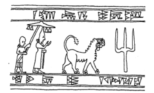
Fig. 8. Bastam Seal Impression (Seidl, 1988: 146, B 2)

Brown (1960: 14-21) commented that lions from Ziwiye (Fig. 31) have been affected by the art of Assyria, Syria and Anatolia and Azarpay (1968: 40, 119) compared them with the Urartian lions. The author thinks these lions are very much