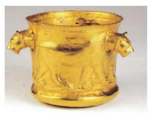
Fig. 3. (Biglari and Abdi, 2014: 91)

ures in the Urartian kingdom according to the reign of the kings could cause the confusion.