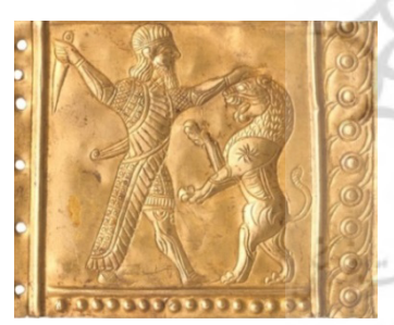
Fig. 31a. Plaque in Reza Abbasi Museum