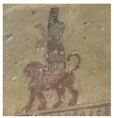
Fig. 5. Erebuni Temple

deity over the bull as Šiwini. But the author suggests that Haldi and the lions in front of him represented the power of Urartian king facing the Assyrian army. Therefore, the winged disc deity or any deity over the bull could be the symbol of power or the protective figure as it is illustrated on many objects mostly armors. Additionally, there is no discovered text or inscriptions introducing the lion as the symbol for Haldi. Also, the winged disc has not always been the symbol of Sun Deity even in Mesopotamia and it seems that Egyptian Ra' was the reason some scholars associated the winged disc with all the Sun deities. Šiwini's function is more related to justice according to the Urartian inscriptions (Dara, 2018a: 226) therefore it is also possible that Šiwini as the winged disc deity riding the bull was protecting the objects form the harm of the enemies as it was mentioned in the Urartian inscriptions.