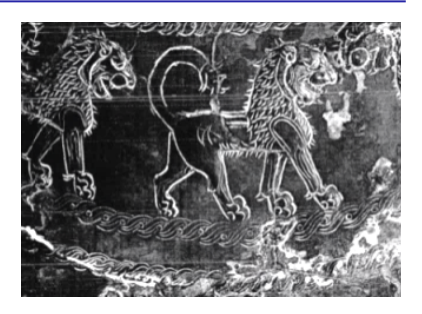
Fig. 17a. From Rusa II's Reign in Ayanis (Salvini, 2007: Abb. 5a) Fig. 17b. From Rusa III's Reign (Azarpay, 1968: plate 54)