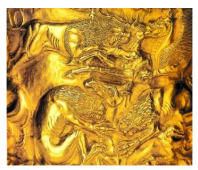
Fig. 27. (Kopovikova, 2006: Fig. 24), Fig. 28. (Kopovikova, 2006: Fig. 24)