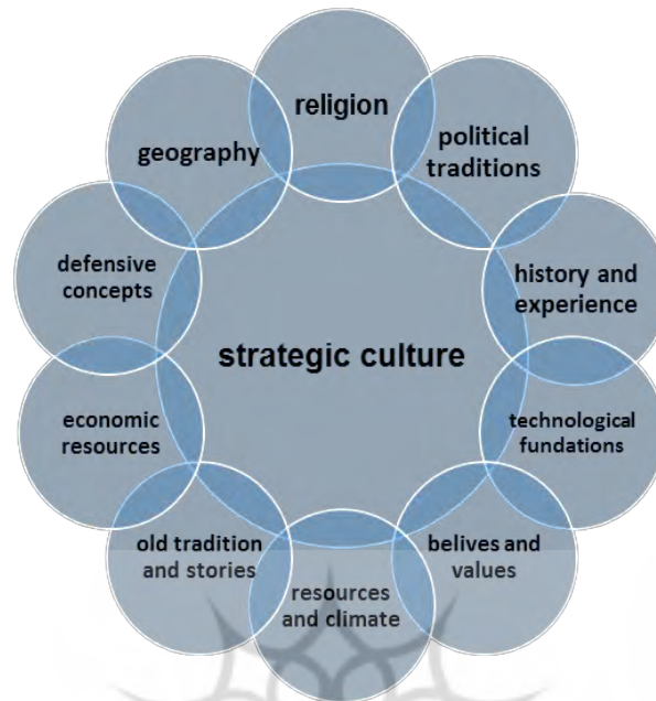
Figure1. Constructive General Factors of Strategic Culture