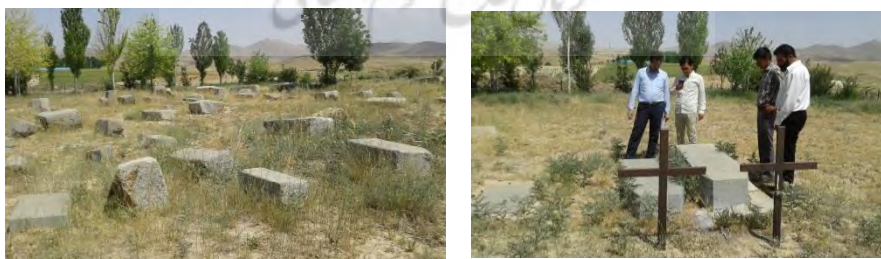
Figure2 (b). Landscape of Armenian Cemetery in Singerd Village