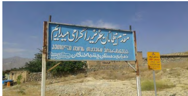
Figure2 (c). Sibak Georgian Village, Isfahan Province (Source: Authors, 2020)