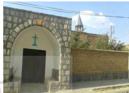
Figure2 (d). Figure 2-d. Zarneh village as the only village where all the residents are Armenians, Isfahan province