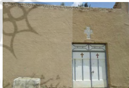
Figure2 (e). Khoyegan Oleia as the only village with three churches, Isfahan province