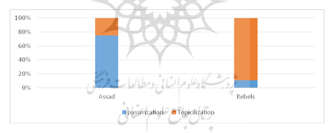
Figure 1. Distribution of Passivization and Topicalization in Tehran-Times