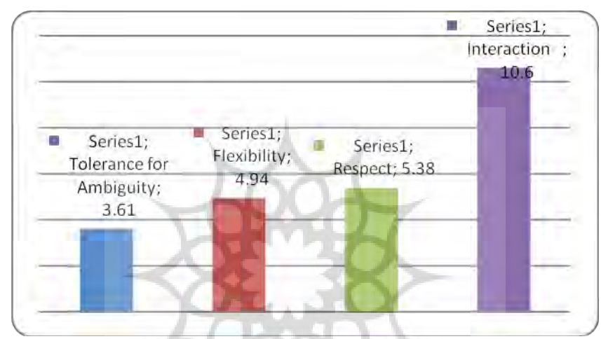
Figure 2. Comparing the Mean Values of the Four Contributors in Questionnaire 2

The information in figure 2 indicates that subjects are tolerant about the ambiguity of other cultures (items 1, 2), moreover; they are very flexible (items 3, 4) and respectful (items 5, 6) about foreigners. Finally, what is evident is that they are very willing to interact with the people of other cultures. (items 7, 8, 9, 10).