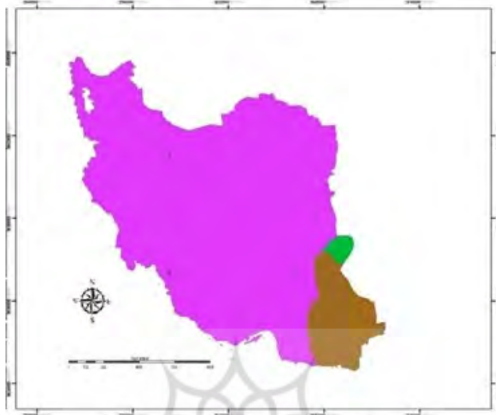
Map 1: location of Sistan and Baluchistan and Sistan in Iran map.

in the far eastern part of Iran. This area is part of the vast province of Sistan and Baluchestan and placement in the north of the province, a large and important part of the province is allocated.