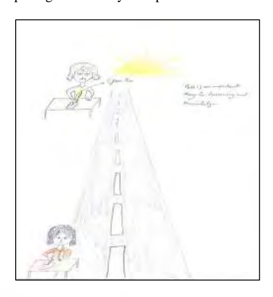
Figure 4. Pens as Important Tools

advertisement in her own experiences of life where prestige and money is important.