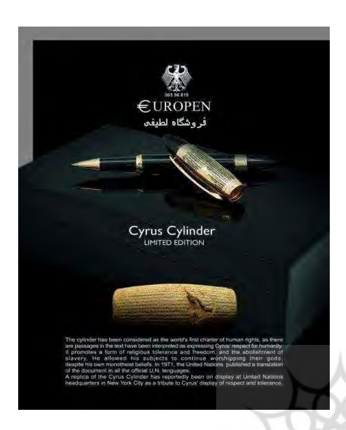
Figure 2. Cyrus Cylinder Pen Advertisement

The text in Figure 2 combines the visual and linguistic modes in an extremely delicate way to advertise this product. The image of the Cyrus Cylinder at the bottom of the figure and its reproduction on the golden lid of the pen connects the Iranian rich culture to the users of the pen. In fact, the advertisement implies that the users of the pen can identify themselves as those who follow the precious words of Cyrus about human rights. Furthermore, the gold and diamond used in the design of the pen restrict the users to a special class of the society, the rich. Thus, although the pen has been specifically designed by and for Iranian customers, 90% of the language used for the advertisement is English rather than Persian. In addition, the brand name, Europen, starts with €, the symbol used for the currency of the European countries. The fact is that the product is advertised in mass media by the same name written in Persian alphabet, "يوروين", which is so strange.