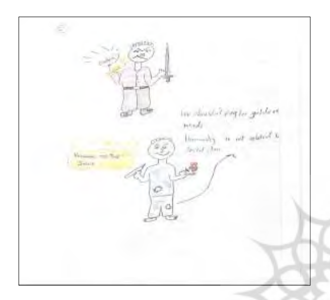
Figure 7. Two Different Views on Pen

The entanglement of various textual modes revealed that the producers had diverse viewpoints in their creation and imagination (Figures 6 & 7). The style of the visualizations elucidated different interpretations of the texts applying unique forms of imagination mediated by text, picture, and imaginary visualizations. The creator of Figure 6 utilized the paradoxical information to organize the connection between the text and its visualization.