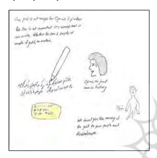
Figure 5. Student's Interest in Simplicity

According to Ajayi (2008), advertisements can vigorously prompt a gradual shaping of the self since the textual exposures might influence the performances of adolescents in social semiosis. In particular, such texts can assist adolescents to gain personal values. Figures 4 and 5 reveal two students' identities types reflected in their interpretations of the Cyrus Cylinder pen advertisement.