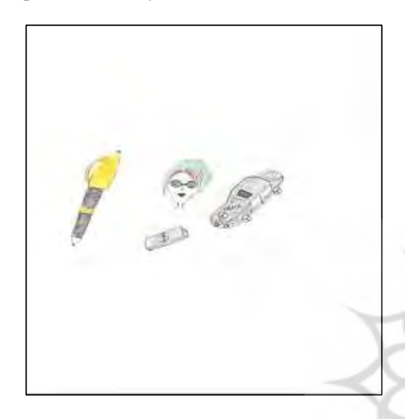
Figure 9. Type of Pen and Social Class

symbols to convey messages. The illustrator of Figure 8 communicated a symbolic meaning (a meaning that goes beyond the material representation of the image) on her interpretation of the text. Through foregrounding, specific hairstyles, and types of clothing, the illustrators depicted the images in Figures 8 and 9 as salient. The images had cultural symbolic values-the individuals in the frames were fashionable, belonged to a distinctive social class, and had markers of personal identity.