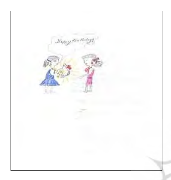
Figure 3. Pen as a Birthday Present

Cyrus Cylinder, yellow to show the golden color of that part. The student conveyed her message more through the facial expression of the girls and the colors she used in a particular way. For example, the two girls were smiling in the figure, showing that both of them were satisfied with the