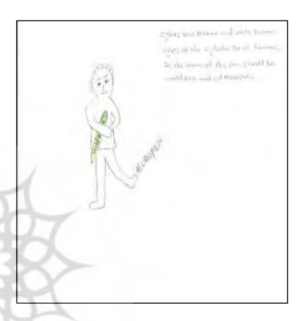
Figure 6. Student's Global Identity

disabled," as is drawn in the figure. In fact, the Cyrus Cylinder pen advertisement caused the student to follow the features of Cyrus and illuminate it in a textual manner; i.e., the selection of particular symbols, encompassing the appearance of the text in addition to the written form can entail changes in the creator's personality features. This issue indicates that the application of different textual modes can be conducive to the facilitation of learners' imagination and development of novel worldviews and as a result transformation of self.