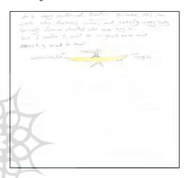
Figure 8. New Ideas for Advertising a Pen

the prestige it brought for him and the social class with which he could identify himself. However, in practice, a completely different thing happens. But the case of the second man is totally different. He is holding a very simple pen, with no color, in his right hand but the words he had written with this pen were so valuable that they were shining like a piece of gold. The words read "Humans are the same." Furthermore, unlike the first man, who was holding a sword, the second one was holding a flower in his left hand which was the symbol of humanity and observing human rights.