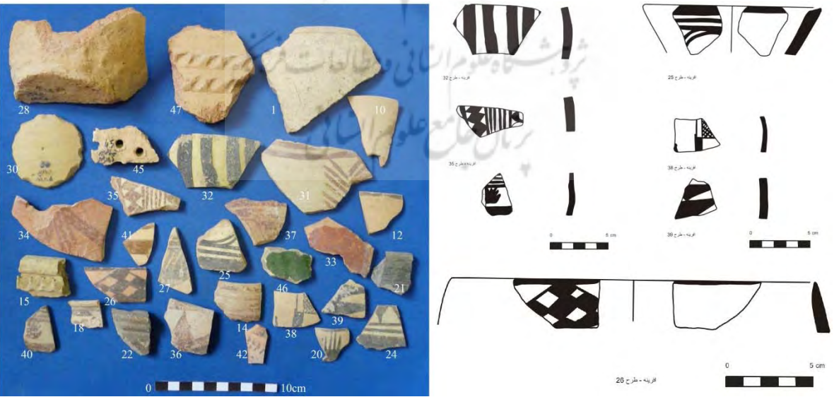
Fig. 1. Afrineh, Pottery of Different Phases of Chalcolithic Period.