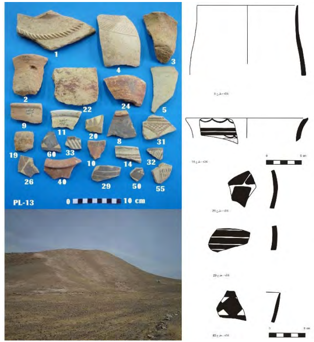
Fig. 3. Kalateh, Pottery Fragments.