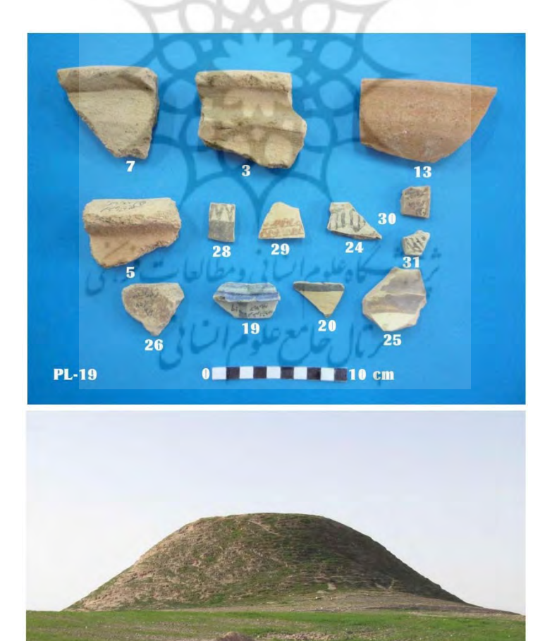
Fig. 2. Vashian, View of the Mound and its Pottery Fragments.