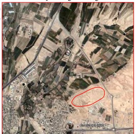
Fig 2 Satellite Image of Tape Sofalin and Tape Shoghali

One of the most important new finds with regard to the Proto-Elamite horizon is Tape Sofalin and its twin settlement Tape Shoghali (Fig 2).