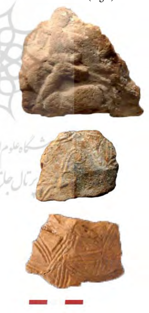
Fig. 5 Examples of Sealing Recovered from Tape Sofalin with both Geometric and Naturalistic Impressions

Among other lines of evidence, the sealing from Sofalin shows a close affinity with Susa. This fact regarding the distance and the existence of many other settlements between the two that do not contain this trait is peculiar. A large number of glyptic scenes from Sofalin exactly parallel sealing from Susa II and Susa III levels. The cylinder seals from Sofalin bear a variety of motifs including simple geometric to highly naturalistic representation of animals and humans (Fig 5).