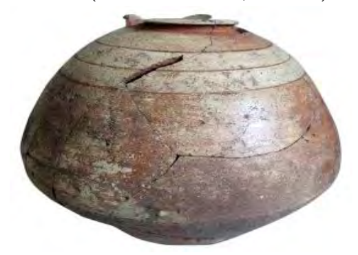
Fig. 7 Carinated Band Painted Jar used for a Burial in Tape Shoghali.

Also three jar burials were recently excavated in Shoghali. Similar band painted carinated jars that discovered in Shoghali (Image 7) were used for burials in the nearby settlement of Arisman (Vatandoust et al., 2011:70).