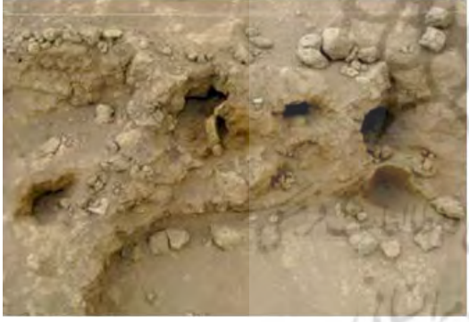
Fig. 8 Some Details of the Pyrotechnical Installations Recovered in Tape Shoghali.

The furnaces in these workshops are equipped with vents and pieces of molds, litharge cakes or sulfide monoxide and slags have been found in the area. Beveled rim bowls and flat trays were also present in this context. The details of these workshops are under study but the preliminary results show that silver was separated from lead sulfides through the cupellation