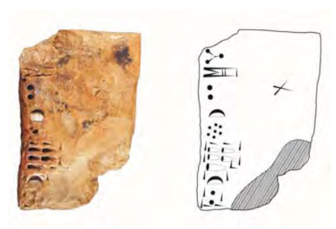
Fig. 4 Examples of Proto-Elamite Tablets Recovered from Tape Sofalin

This is a significant fact and shows that the idea of the record keeping was practiced in Sofalin being contemporary to Susa or at least not much later than the start of the new trend in Susa. The potential paths and mechanisms that facilitated relatively fast paced communication remains to be investigated, but most possibly the mobile segment of the population had a role in this process. In his proposed complementary model of the sate formation process in southwestern Iran to that of Wright and Johnson (1975), Alizadeh claims that only a non-urban polity could be the most likely production force capable of presiding over interregional trade during this time (Alizadeh, 2010). As an explanation for the vast spread of the Proto-Elamite administrative tablets on the Iranian plateau he asserts that, "If the general similarities in material culture of western Iran and central Mesopotamia are taken as indicating a pattern of interregional tribal alliances, such alliances then provided a mechanism through which Proto-Elamite administrative tablets could be widely distributed" (Alizadeh, 2010: 371-372). In a similar line of argument, Boehmer believes that a portion of cultural indicators such as