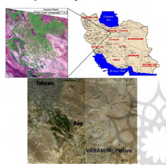
Fig. 1 Location of Proto-Elamite Settlements Across the Iranian Plateau

Scholars define the Proto-Elamite archaeological phenomenon by the appearance of Proto-Elamite writing, the first form of local writing on tablets, in many cases together with specific types of other management/ administrative- control tools, over a vast geographical territory across the Iranian plateau (Fig 1).