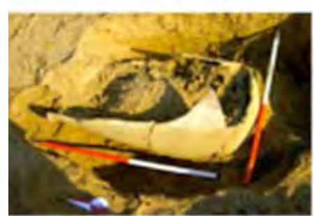
Fig. 6 Jar Burials Recovered from Tape Sofalin

Also three jar burials were recently excavated in Shoghali. Similar band painted carinated jars that discovered in Shoghali (Image 7) were used for burials in the nearby settlement of Arisman (Vatandoust et al., 2011:70).