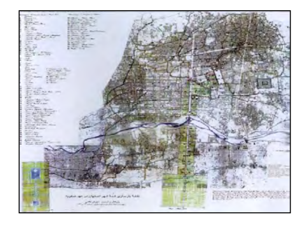
Fig.2. Isfahan in Safavid Period (Gaubeh, 1987:295)

Abbas's reign (Blake, 1999:115). In addition to the economic function of Nagsh-e-Jahan square, the aspects of social and political function are important since ambassadors many foreign and representatives were received at Ali-Qapu palace. Celebrating national events such as Nourooz, attending polo and being the place of wrestling were other social functions of this square. In a general definition, Nagsh-e-Jahan square, as the royal performance of Shah Abbas's political and economic power. is interpreted by an obvious form and architectural elements, mosque, bazaar and palace (Briniuli. 2007:65). It could be concluded from studies on physical appearance of Isfahan that the Safavid urban-planning is in accordance with the tradition of Islamic urban-planning in which three aspects of human life that is spirituality, life and aristocracy (political power), has been shown by mosque, bazaar and palace as the main constituent elements of urban texture. The king's second main action on the urban-planning in Isfahan was the construction and development of Chahar-Bagh Street. It had the same spatial and physical functions of Qazvin Street in Shah Tahmasp's reign. The theaters were performed in Chahar-Bagh Street besides helping people to pass their spare time, would prepare the ground for providing the sense of unity and integrity by the first national independent government in Iran (Chardein, 1335: 134-135). Uncommon size of street in length and utilizing four rows of green.