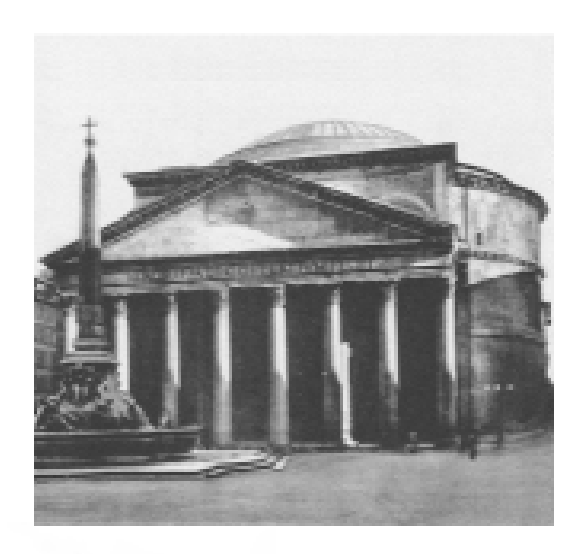
Fig 3. Exterior of Pantheon

Pantheon, which was rebuilt during the 2nd century after consecutive fires, hosts the light under its great dome in the forms of daylight and sunlight. Both literal and metaphorical use of lighting presents the sense of space together with the divine beauty (Semes, 2005:54). The daylight diffuses gently in the interior space while the sunlight falls directly from the oculus and moves whole day on the coffers of the inner dome surface. These two contrary movements transform the sunlight and the daylight from natural to spiritual ones. Visitors perceive these natural lights once they stand beneath the oculus. In other words, the sunlight gives visitors the feeling of the power of nature or they perceive the divinity via daylight.