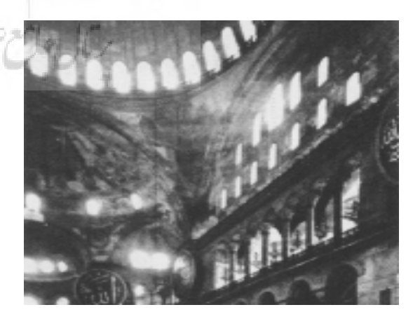
Fig 6. St. Andrea Church

Renaissance could transform the spiritual spaces of middle ages by invoking solid and geometrical designs. Instead of changing the world a calm place under God's command, the Renaissance made humanism as the main axis. Circular plan became the symbol of controlling dynamic energy in axis and organizing space.