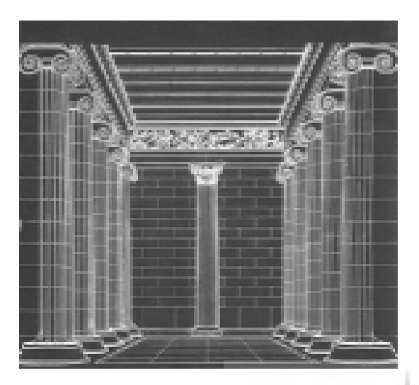
Fig 1. Apolon Temple

It was widely believed that "temple should be predominant among other structures" (Gardner, 1991:45). A temple structure, as usual, consisted of one or two rooms called naos . These rooms have a single door without any window but occasionally there were porticos or two stones between projected walls.