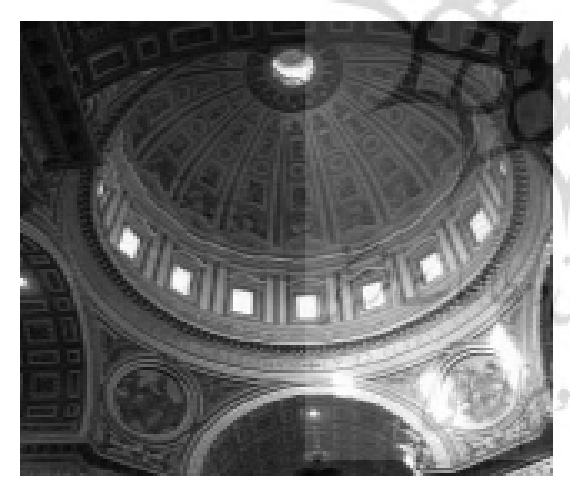
Fig 8. St. Pietro

An over-scaled, convex -concave "billboard" surmounted by a huge oval niche, proclaims it to be a small church. On its roof, a domed lantern is paired with a columned tower, twisted at forty-five degrees to inflect toward this important crossroad.