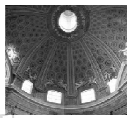
Fig 7. St. Andrea

dramatic shadows and illuminating the opposite wall with an ethereal glow.