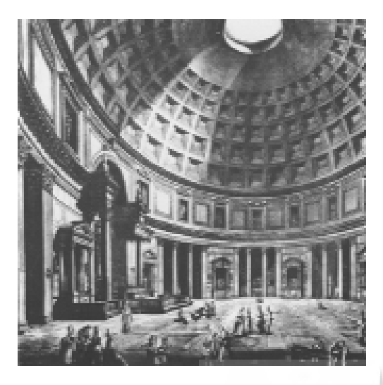
Fig 2. Interior Pantheon

Pantheon, which was rebuilt during the 2nd century after consecutive fires, hosts the light under its great dome in the forms of daylight and sunlight. Both literal and metaphorical use of lighting presents the sense of space together with the divine beauty (Semes, 2005:54). The daylight diffuses gently in the interior space while the sunlight falls directly from the oculus and moves whole day on the coffers of the inner dome surface. These two contrary movements transform the sunlight and the daylight from natural to spiritual ones. Visitors perceive these natural lights once they stand beneath the oculus. In other words, the sunlight gives visitors the feeling of the power of nature or they perceive the divinity via daylight.