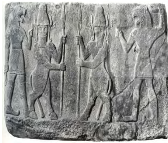
Fig 3. The "Man-bull" and the "Man-lion", Orthostates of Kargamis, 1050-850 B,C, Archeology Museum, Ankara.

Sporadically, the Gods with human face also have the traits of animals, such as wings, horns, or they arrive at associations with elements, water and fire, with branches and in forms resembling the mountain. The men-bulls exceed other faces in number, but men – from a distance lions and men-birds often appear more since then.