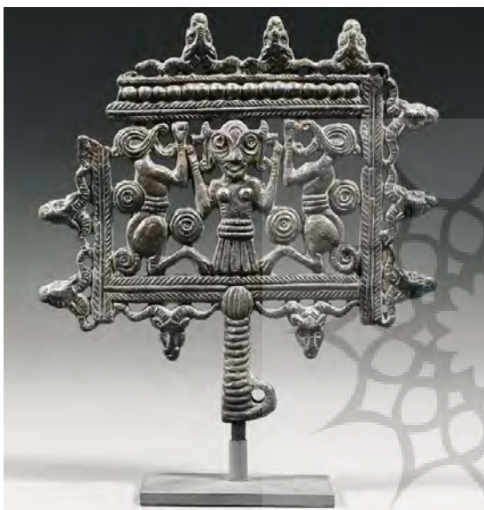
Fig 7. Master of animals, Luristan, 9 th -7 th B.C., h. 16 cm.

Two animals in the aspect of the griffon without wing were fixed and at the back of the body in the front, so that we determine three heads at the same time on a body: two heads of the griffon and one of the man-bull (fig.8).