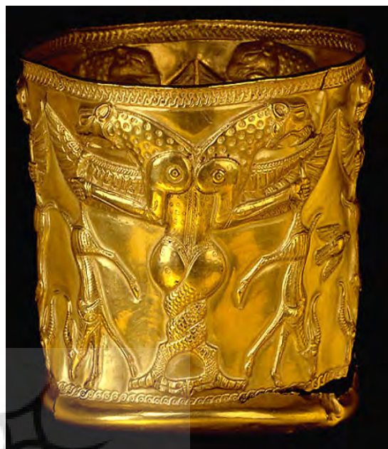
Fig 10. The monsters interlace, Goblet decorated with Master of Animals, Grasping Gazelles, XIV th - XII th B.C., Marlik, Museum of Louvre.

The manner of the trait of the interlaced legs is very close in style Mesopotamian, in other words, Mesopotamians characteristics.