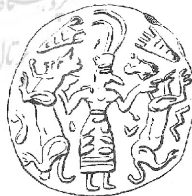
Fig 1. Seal found in Susa. (AMIET 1966 : pl. 6, fig. 119A, dessin P. Amiet).

In the south of Mesopotamia, in Sumer, the first figurative creations were found which are in complete human or animal forms, and, only sporadically, we see animals moving in upright position.