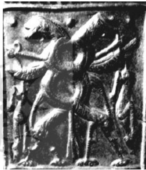
Fig 9. The Master of Animals, Bronze Plate , Luristan, II th B.C.

The fur of the belly of monsters, treaty in parallel bands, is delimited by a slanting band; between monsters tomb, a kind of similar "pendant" in their tail which stands, long and barely bent.