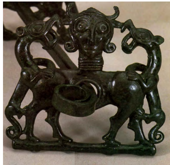
Fig 8. Mors, Bronze, Ages of the Iron II -III (1000-700 B.C.), Archeology Museum, Francfort-sur-le-Main

However, we can determine another type of the master of animals who can be more terrible and more dreadful than the precedent ones. It is a monster composed of two interlaced real or wonderful animals.