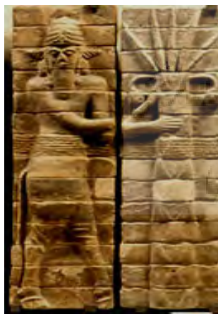
Fig 2. The "Man-bull", Panels of molded bricks, the middle of XII th c. B.D., Place of Apadana, Susa, H.:1,355 m; W.: 0,375 m. Museum of Louvre.