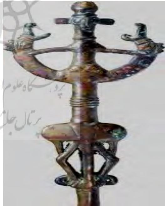
Fig 6. Idol « Master of animals », Bronze, Ages of the Iron II (1000-800/750 B.C.), Museum für Vor- und Frühgeschichte, Munich.