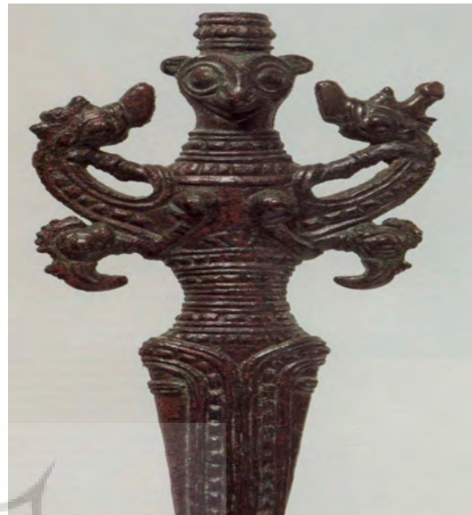
Fig 5. Idol, Bronze, Ages of the Iron II- III (900-700 B.C.), Rietberg Museum, Zürich.

The art of pre-Elam of the 5 th millennium BC will be principally characterized by the painted pottery, tombs and houses of Susa, of which numerous specimens were delivered. The dinnerware will be decorated, with notable numerous beakers, with motives representing stylized animals in most cases.