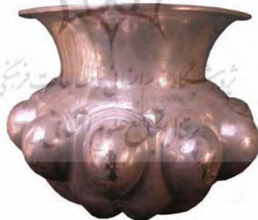
Figure 4 Kalmakarra silver goblet with Elamite inscription.

It should be said that syllable (suffix) “/– na ” is absent. “The Samati king”, such a