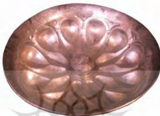
Figure 3 Kalmakarra silver under goblet with Elamite inscription.

and well protected by the heirs. Logically; it does not seem that they have made such a heritage available to the public (Bleibtreu 1999:2-5).