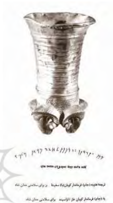
Figure 2 Kalmakarra silver rython with Old Aramaic inscription.

within the territory of Scythians today called as “Kuban” or “Taman Peninsula;