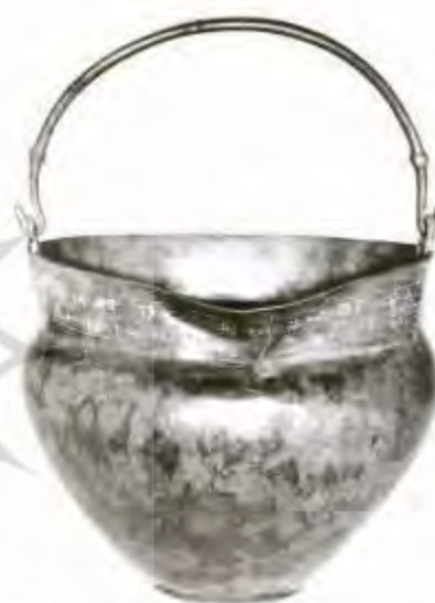
Figure1 Kalmakarra silver bucket with Neo-Assyrian inscription.

This inscription has been engraved on the upper and outer part of a handled silver bucket in Neo-Assyrian language in two lines, in fairly large-sized cuneiforms. The writing style is