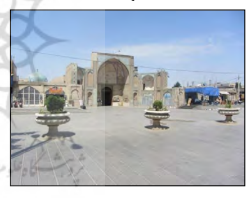
Fig 8. Western side of Sepah Street