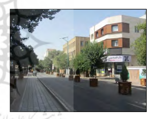
Fig 13. Western side of Khayyam