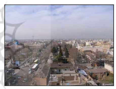
Fig 1. Sabzeh Meydan