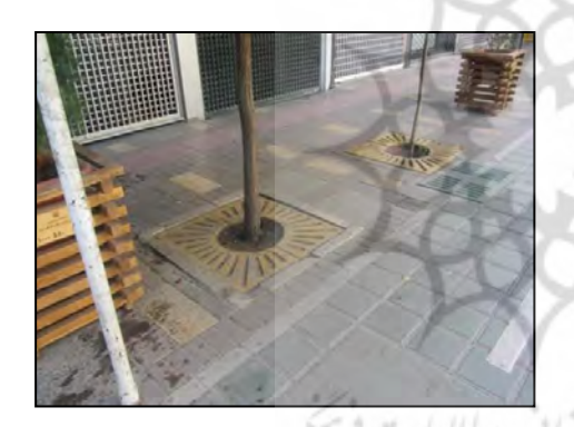
Fig 12. Detailes