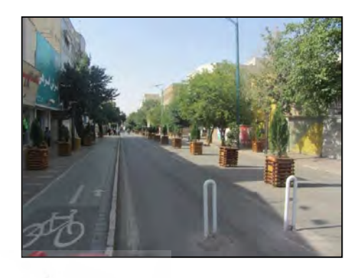
Fig 11. Southern vision of Khayyam