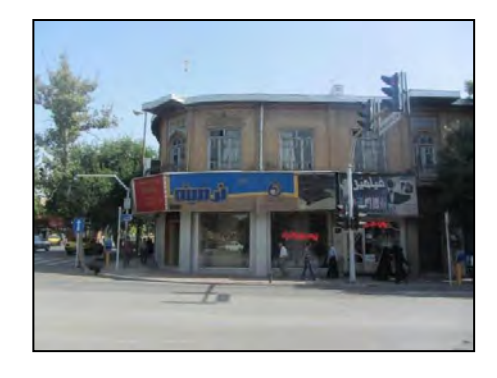
Fig 6. Eastern side of Sabzeh Meydan