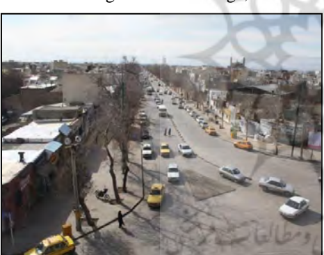
Fig 7. Northern side of Sepah Street

Sepah Street is the first street in Iran which has been constructed in Safavid era when Qazvin was the capital of Iran. This road starts from Alighapou façade and ends to Jame Mosque and its evolved plan could be observed in Chahrbagh after capital shift to Isfahan. In Shah Safi era, the street was continued from southern side to the cemetery of the city. At first, it was named Dolati Street and in Pahlavi Era it was called Sepah while currently has been recognized as Shohada Street. There has been variety of usage for this street including residential usage, bazar and commercial malls, Jame Mosque, cistern, and so on.