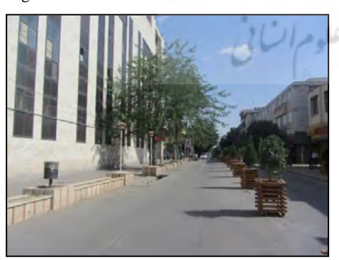
Fig 14. Northern vision of Khayyam