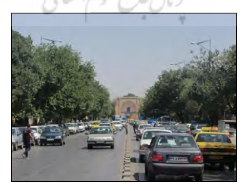
Fig 9. Northern vision of Sepah Street