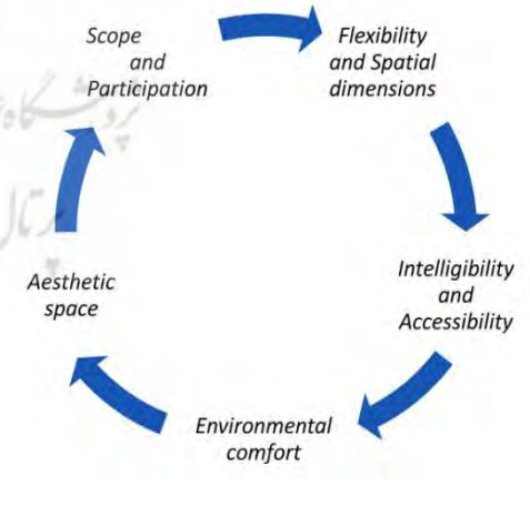
Fig. 2. Model of students' satisfaction in educational spaces