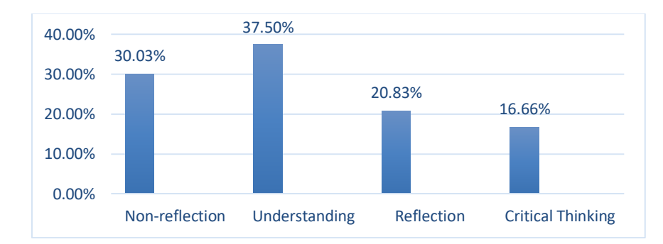
Figure 3, Levels of reflective thinking manifested in the writings of CG's Participants.

According to the above figure, 20.83% and 16.66% of the CG's participants met the criteria of criticality and were placed in the reflection and critical thinking categories. Yet, the majority of writings (67.53%) did not manifest any signs of critical thinking. Afterward, kappa statistics were used to test inter-rater reliability.