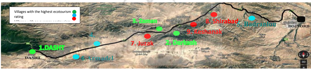
Figure 3. categorization and position of selected villages along Bojnord to Golestan road.