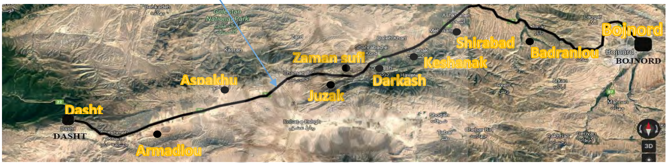
Figure 1. The position of the selected villages on the main road of Bojnord to Golestan (Reprinted from "Google map", 2018,

https://www.google.com/maps/@37.4064192,56.8033481,79692m/data=!3m1!1e3?hl=en)