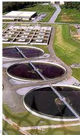
Figure 4: Sewage Treatment System

13_Benefits of using GIS-based management systems: