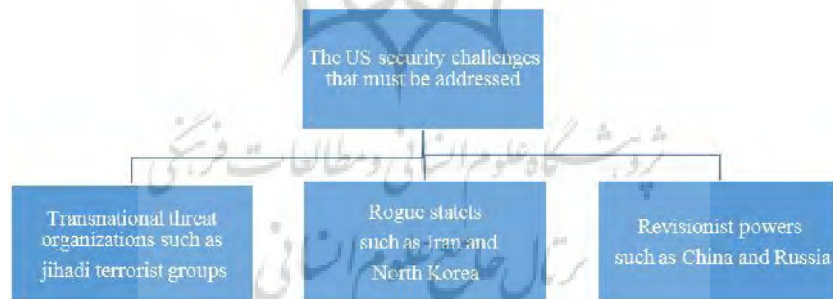
Figure 2: Defined challenges for the U.S. state in the 2017 document