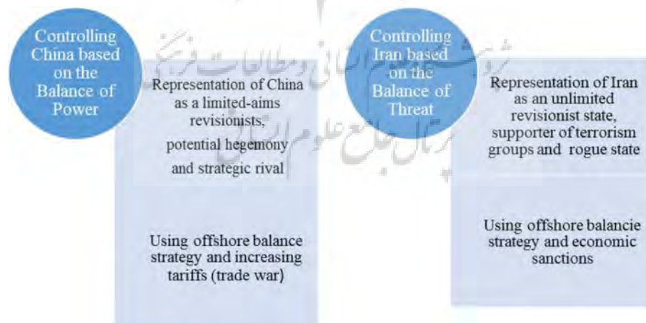
Figure 4: Iran and China in U.S. 2017 National Security Strategy Document

However, based on Trump's perception from Iran as a threatening actor and rogue state in international system, besides using of offshore balance strategy, he has resorted to sanctions to pressure on Iran. Its clear example can be seen in the U.S. Withdrawal from the (JACOBA) and the imposition of more severe sanctions against Iran. In this regard we can refer to the June 2017 congressional enactment, titled "Countering America's Adversaries Through Sanctions Act", that imposed sanctions on Iran, North Korea and Russia and on August 2, 2017, Trump signed it.