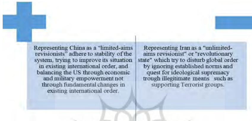
Figure 3. Trump's perception of China and Iran's revisionist behavior