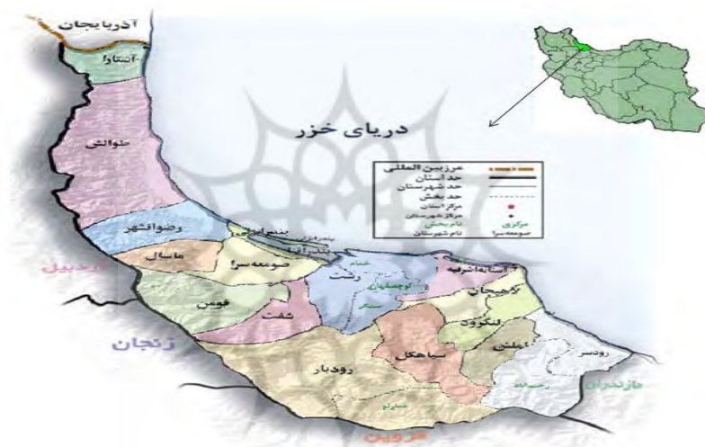
Figure 1. Geographical Location of Langerud County, Guilan Province.

efficiency frontier would be efficient, otherwise it is inefficient. As in this method, the efficiency is calculated only from the optimistic perspective, and a precise and definite number is provided as the efficiency of a unit, it is unable to provide a comprehensive assessment of efficiency. Since in a bounded DEA, the efficiency of units is measured in a range between the lower and upper limits, a more comprehensive assessment of the efficiency of the unit is provided. Therefore, in this study, this method is used for evaluating the efficiency of the Health Houses in Langerud County which serve as units promoting the health and safety of people.