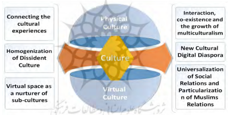
Figure 1. Capacities of Dual Spacization of Culture

'Cultural Diaspora' has always come as a result of physical immigration or displacement, while digital and network diaspora (Larner, 2015) as a new cultural phenomenon is a product of the mental departure and a change in the values and thoughts of individuals due to the introduction to the virtual world (Ameli, 2011a). This cultural phenomenon is capable of affecting one's nationalistic tendencies as well as national and collective identities. In such a connected environment motivation for interaction is locally and globally increased and attitude for going around the world to visit or immigration is inspired (Cover, 2015; Thulin & Bertil, 2016)