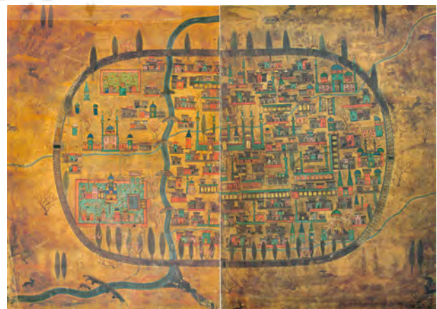
Fig. 1. The miniature prepared by Nasuh, in 1536, Istanbul University library. Source: Yurdayın, 1976: 125.