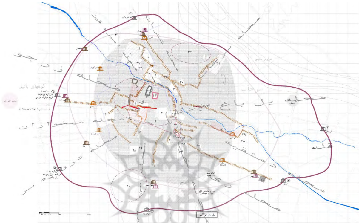
Fig.5. The restored map of Tabriz in late Safavid era and its conformity with present condition. Derivation: author.

itinerary of Kareri, Qeysəriyə bazaar was located between Old Government House and the river in East of the bazaar and it was the center of trade and after that jewelers' House started (Ibid: 46).