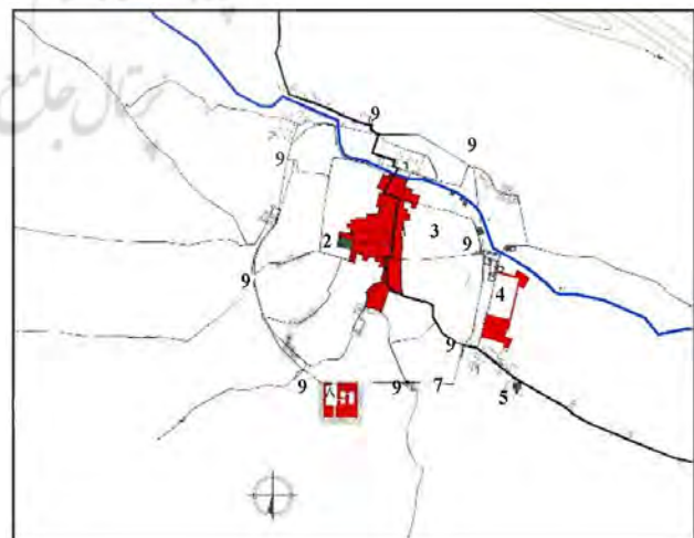
Fig. 7. The reconstructed map of Tabriz in the Qajar era and adapt it to the current situation.