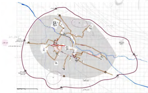
Fig. 3. The restored map of Tabriz in early Safavid era and conformation with present condition. Derivation: author.

In 1566 because of continuous defeat from Ottoman, Shah Tahmasb transferred the capital from Tabriz to Qazvin in order to maintain the power of Safavid. In Rozatoljenan book, which is written in 1567, offers limited information in relation to spatial structure of Tabriz in late Shah Tahmasb era. Although the book involves the cemeteries in Tabriz, however mentioning the tombs, mystics, poets and rulers of the historical era, introduces the architectural elements of Tabriz in the mentioned period. Karbalayi names four cemeteries in Tabriz, Sırxab cemetery in North of Tabriz, Çərəndab in South of Tabriz, Gəcil in East of Tabriz, and Qullə cemetery in West of Tabriz (Table 3). During the same years, Alessandri mentions the circumference of the city as 15 mile and is 9 mile smaller than Tabriz in early Shah Ismail era.