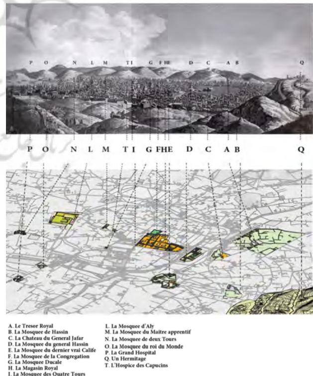
Fig. 4. Rereading the elements shown on the paintings of Schardin from 1084 to 1088 and finding their place on Qajarid map in 1880 according to view of Chardin. Derivation: author.

earthquakes of 1671 and 1681 and 30 years before the earthquake of 1721. During these years, Tabriz had developed and the square of Hasan Padishah Mosque and Hasan Bəy Palace had regained its fame and there was a concert in one of the terraces every evening (Kareri, 1969: 33). In that time, the Blue Mosque was famous as Osmanlı Mosque, and it was next to two gardens with different trees, but it was not so much respected because it was built by a Sunni (Ibid: 39-41). The place of higher Sheyh Imam 13 that was opposite to Osmanlı Mosque was built by colorful stones and the artistic value of it was higher (Ibid: 41). In addition to Main Square of Tabriz, Kareri refers to Hasan Padishah Mosque next to At Meydanı which were located near Usta Şayırd Mosque and probably it was the same as Qara Külək of Qajarid era. Moreover, between the Usta Şayırd Mosque and Əlişah Dome there was a garden and a little away from it there was a wide square with brick walls that most of religious and public ceremonies used to be held there (Ibid: 41-42). As it is mentioned in that time, the city not only got smaller but the spatial structure of the city had changed too and in addition to Sahib Abad Square as the main square of the city that had a royal mint (Ibid: 46) some of the squares such as the square next