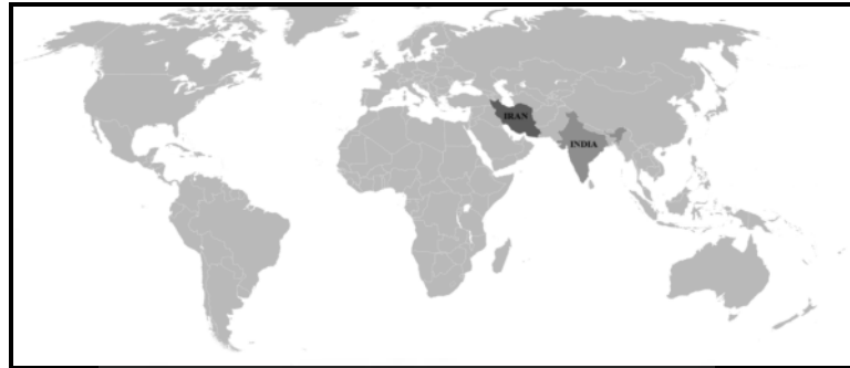
Figure 2. Iran and India's location in the world map

the type of its government is Islamic Republic with one legislature. Persian is the official language of this country and its capital is Tehran. (Research Branch and Cosmography Compilation, 2005: 8), (Figure 2)