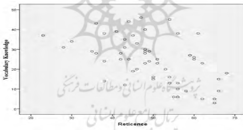
Figure 1. Correlation between Reticence and Vocabulary Knowledge

The results revealed that the learners' reticence correlated with vocabulary knowledge, r(54) = -.511 , p < .01 . Based on Table 4, the learners' reticence in speaking has significant relationship with their vocabulary knowledge. However, the correlation is negative. Figure 1 clearly depicts the correlation between the learners' reticence and their vocabulary knowledge.