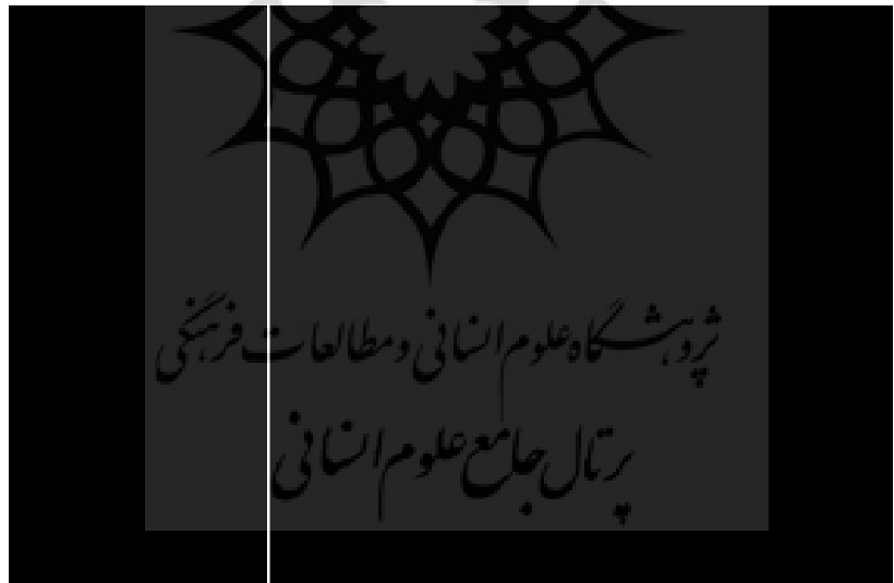
Figure 2. Changes in appropriacy of IMRs use.