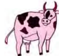
Cows give us beef.

We also need fruit and vegetables. These also help us to grow and be healthy.