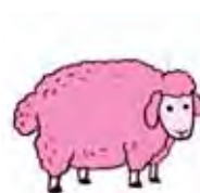
Sheep give us mutton.