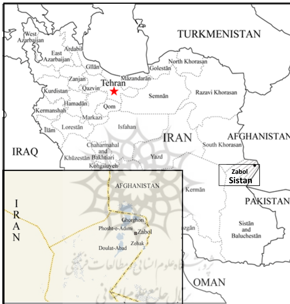
Map 1: Map of Iran with Sistan enlarged 9