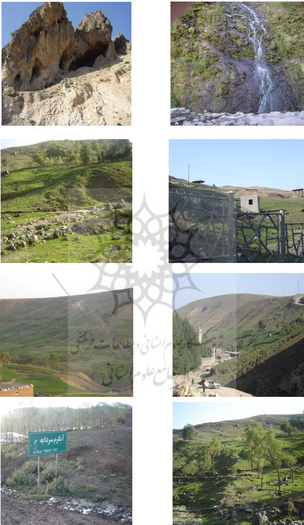
Figure 2: some interesting place in Wakil Abad Village